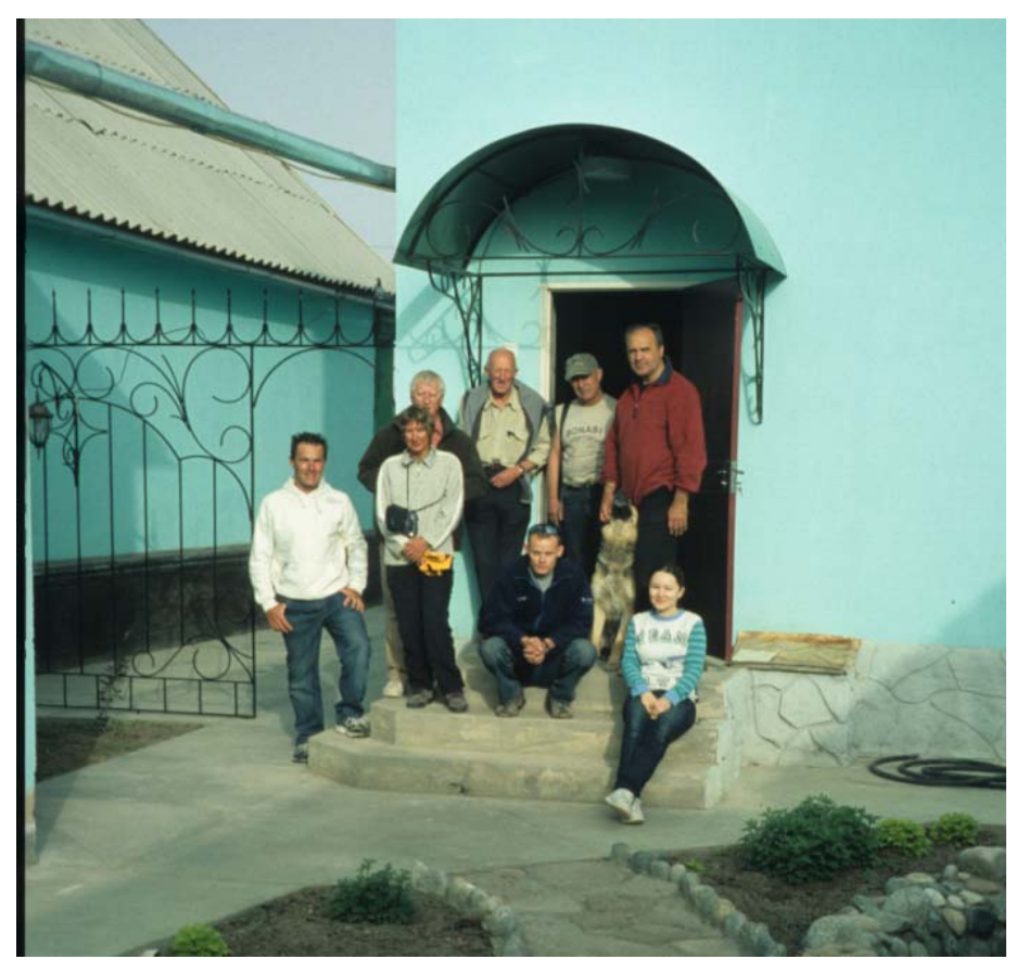
Tamga: climbing team on the left, support team on the right

However, the planned route had been feasible and in better conditions would be a superb trip through spectacular scenery. It was clear that there were many more potential ski peaks in the area as well as some mountains offering challenging lines for alpine ascents in summer conditions. We made 5 ascents of previously unclimbed peaks between 4720 & 4901m despite the conditions and confirmed the value of skis in exploring the Ak-Shirak range in winter, though discussions emphasised pulk design would continue to evolve.